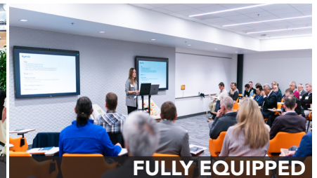
FULLY EQUIPPED SEMINAR ROOM