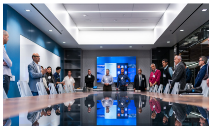
EXECUTIVE BOARD ROOM