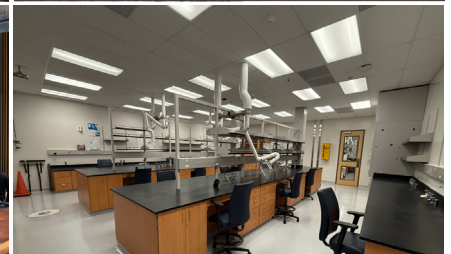
WET LAB SPACE