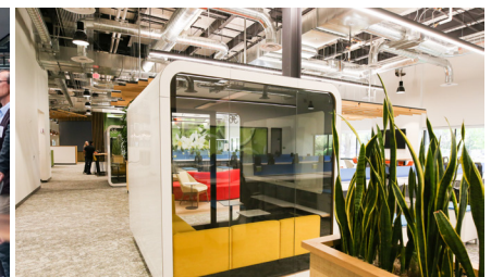
1 OF 39 AVAILABLE BOOTHS